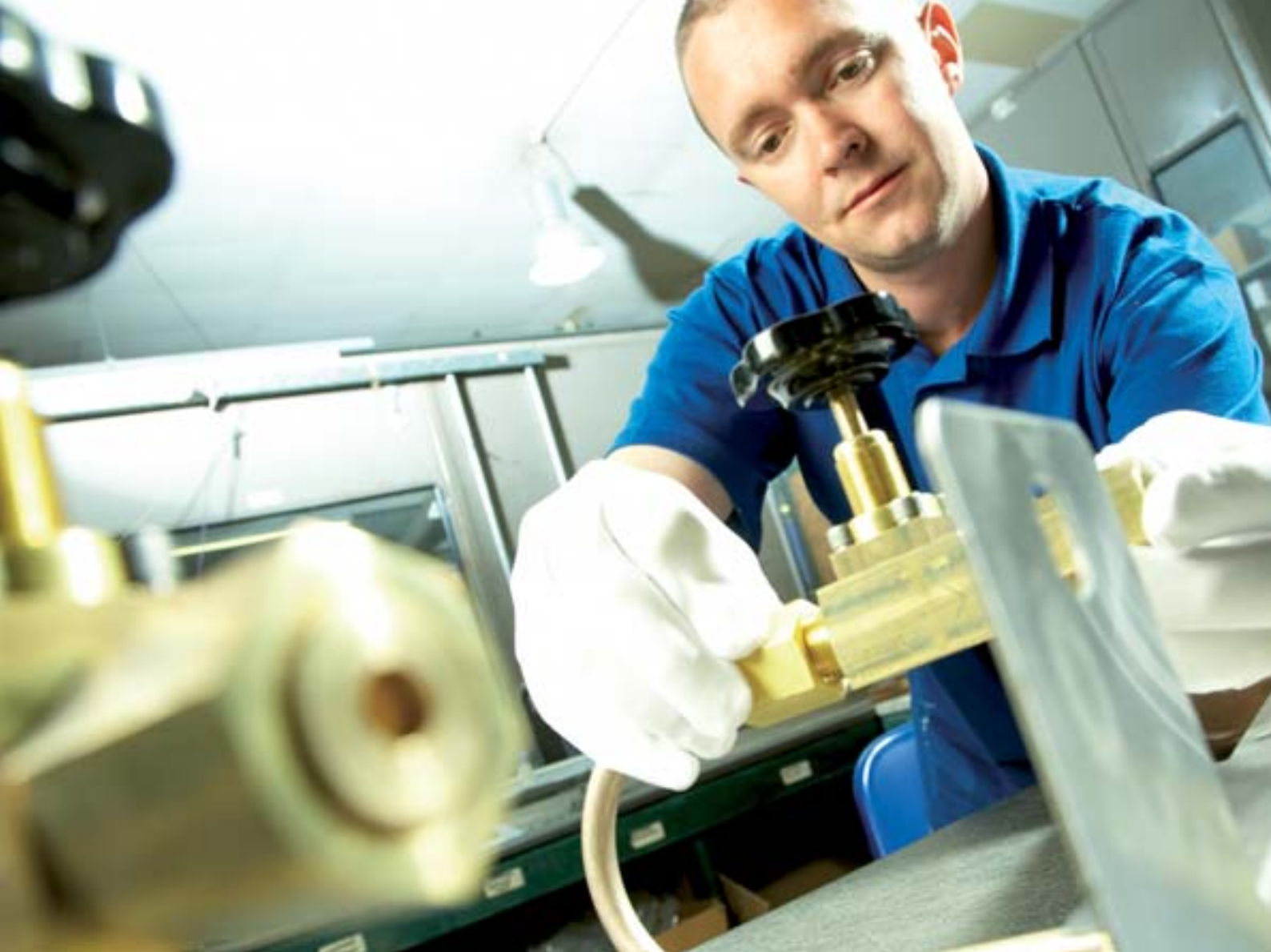
State of the art cleaning and degreasing