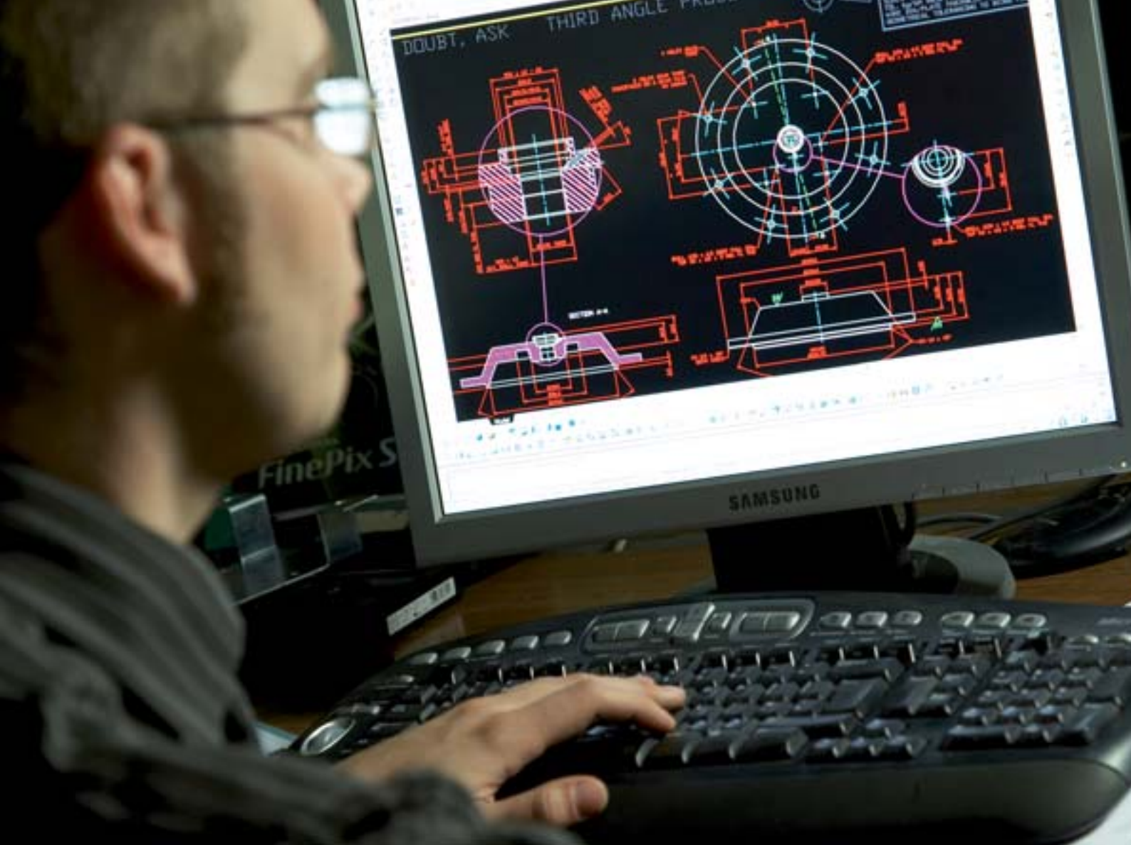
Fabrication and brazing all under one roof